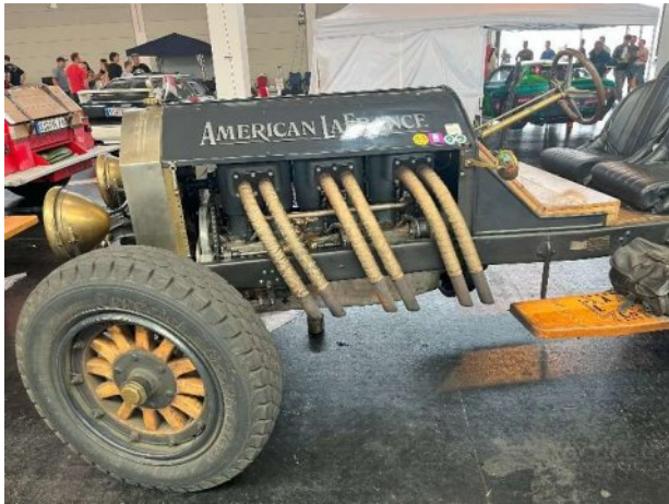
American Lafrance type 75 and 12. 6 cyl. inline, OHV, 14.5 litre engine capacity, fuel consumption 80l/100km (3 MPG), 105- 135 HP, weight 2700 to 3500 kg, built from 1915 to 1929, initially a fire fighting truck