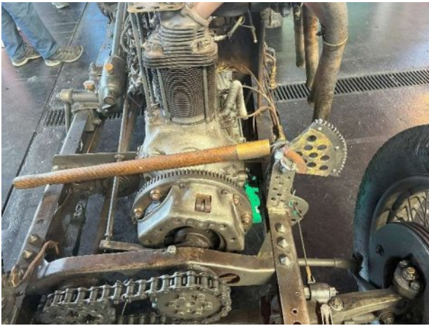
Starting mechanism on the Delahaye