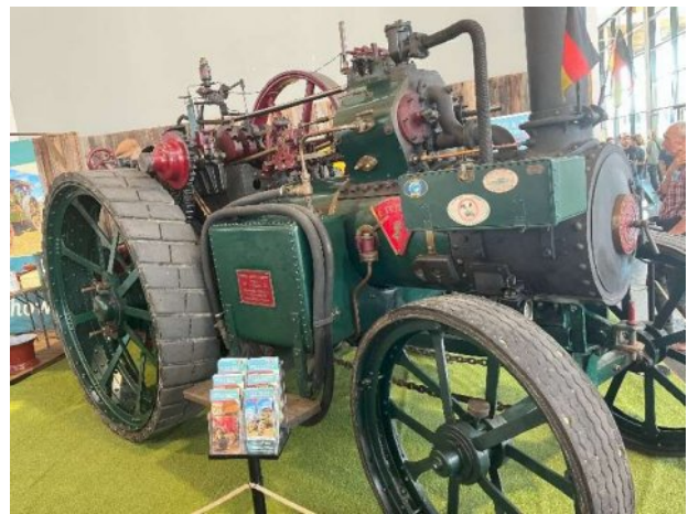
1918 Artillery Tractor - Steam driven Built 1918

35 units were built in Chemnitz, after WW1 it was used for roadbuilding in Latvia. Weight 10 t, 40 HP engine power.