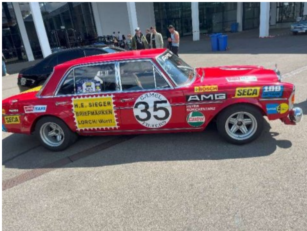
It was called the "Red pig" Rally car