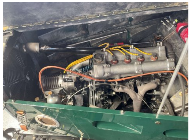
Engine with Compressor