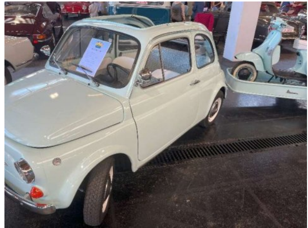
Fiat 500 with trailer and Vespa in tow