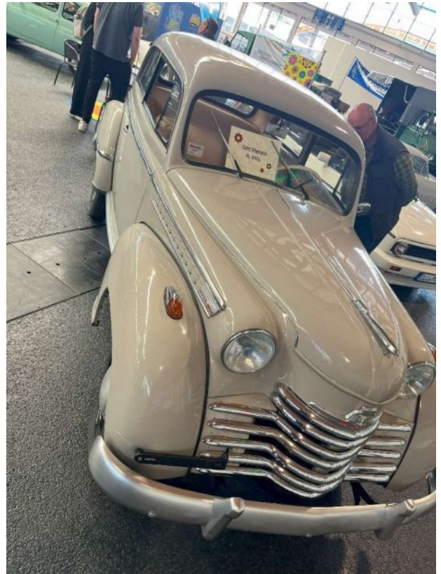
Opel by General Motor akin to Holden