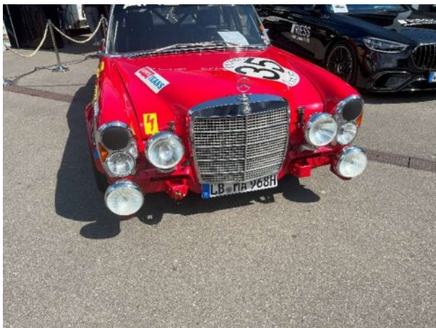
Mercedes AMG 6.3 lt V8 450 HP 265 km/h V_{max}

35 units were built in Chemnitz, after WW1 it was used for roadbuilding in Latvia. Weight 10 t, 40 HP engine power.