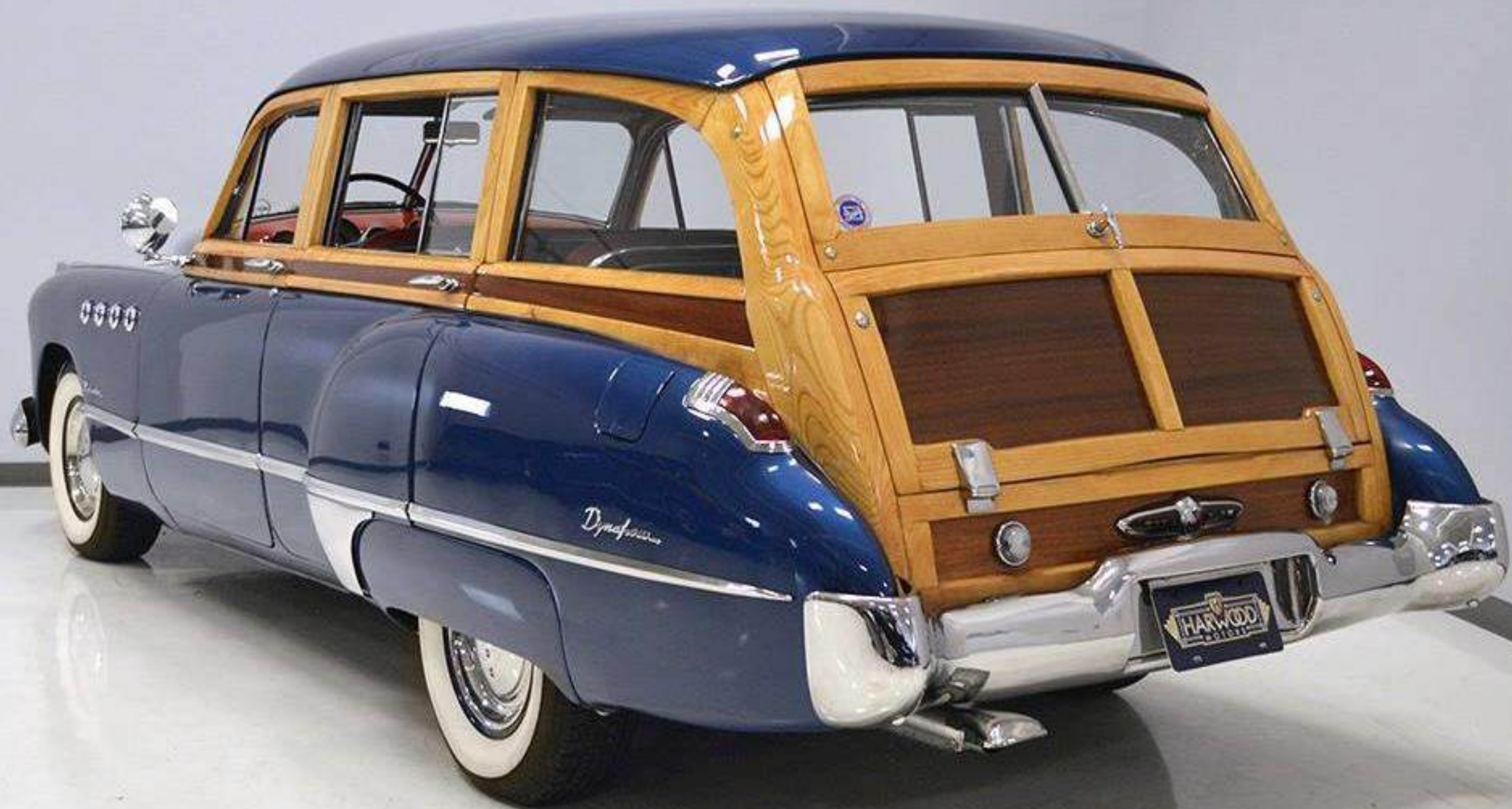
1949 BUICK ROADMASTER