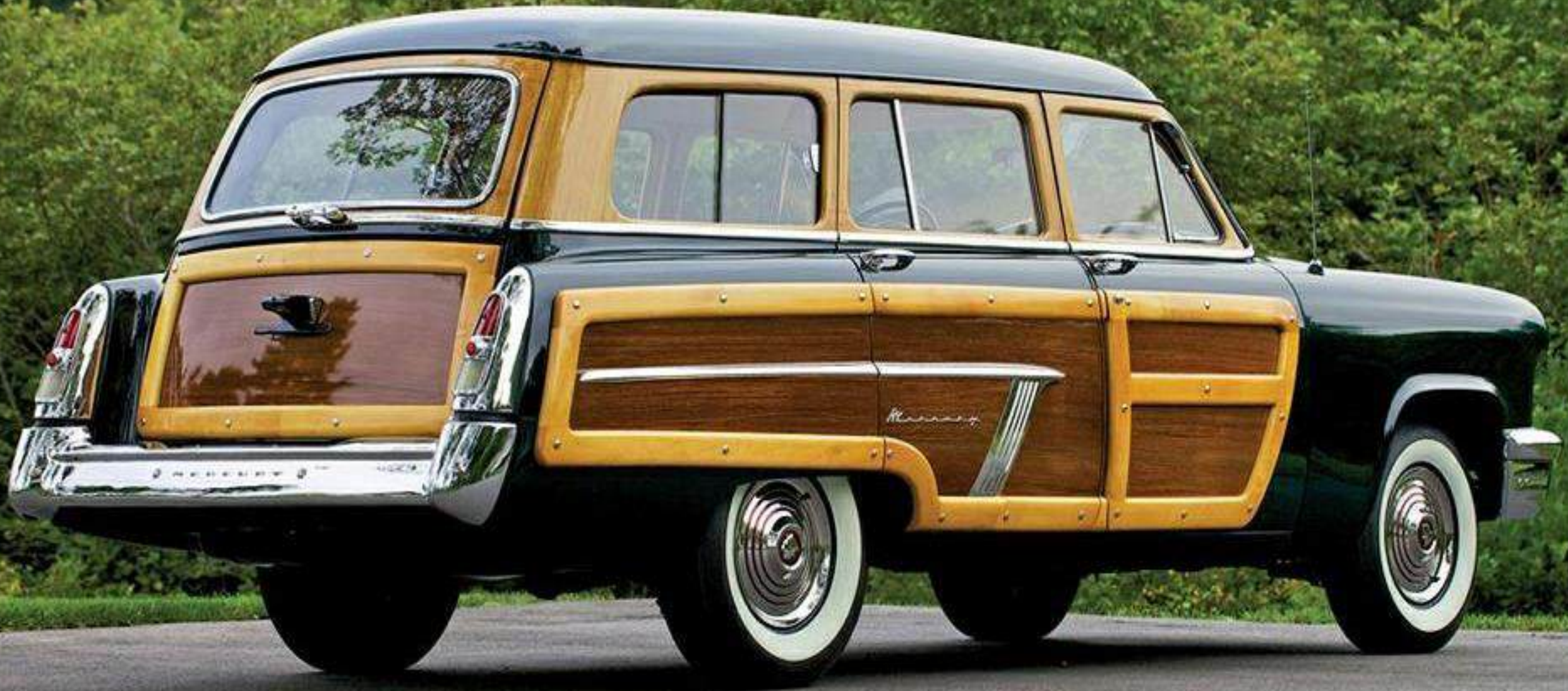
1952 MERCURY MONTEREY