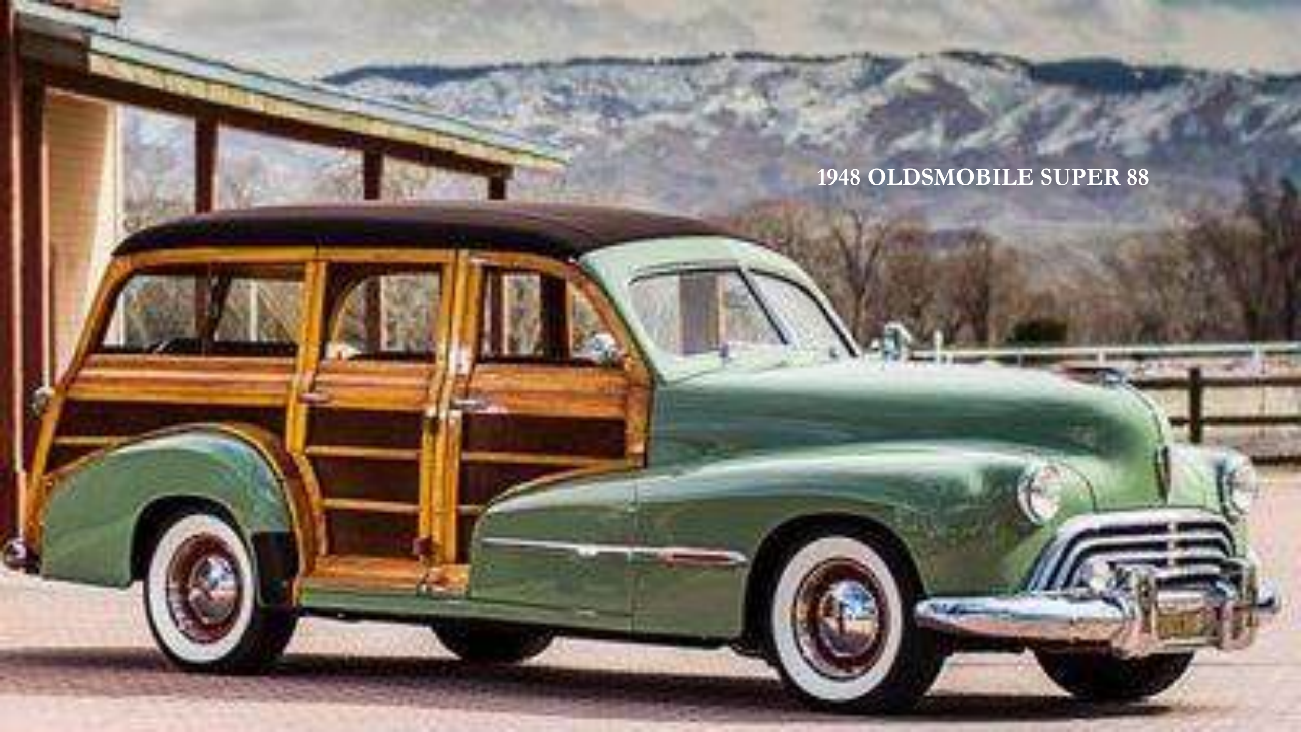
1948 OLDSMOBILE SUPER 88