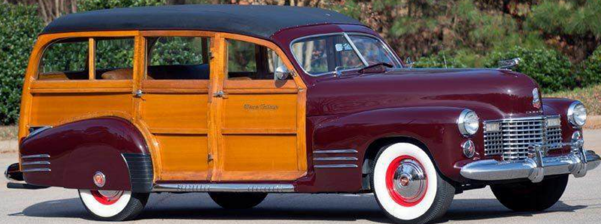
1941 CADILLAC ESTATE WAGON