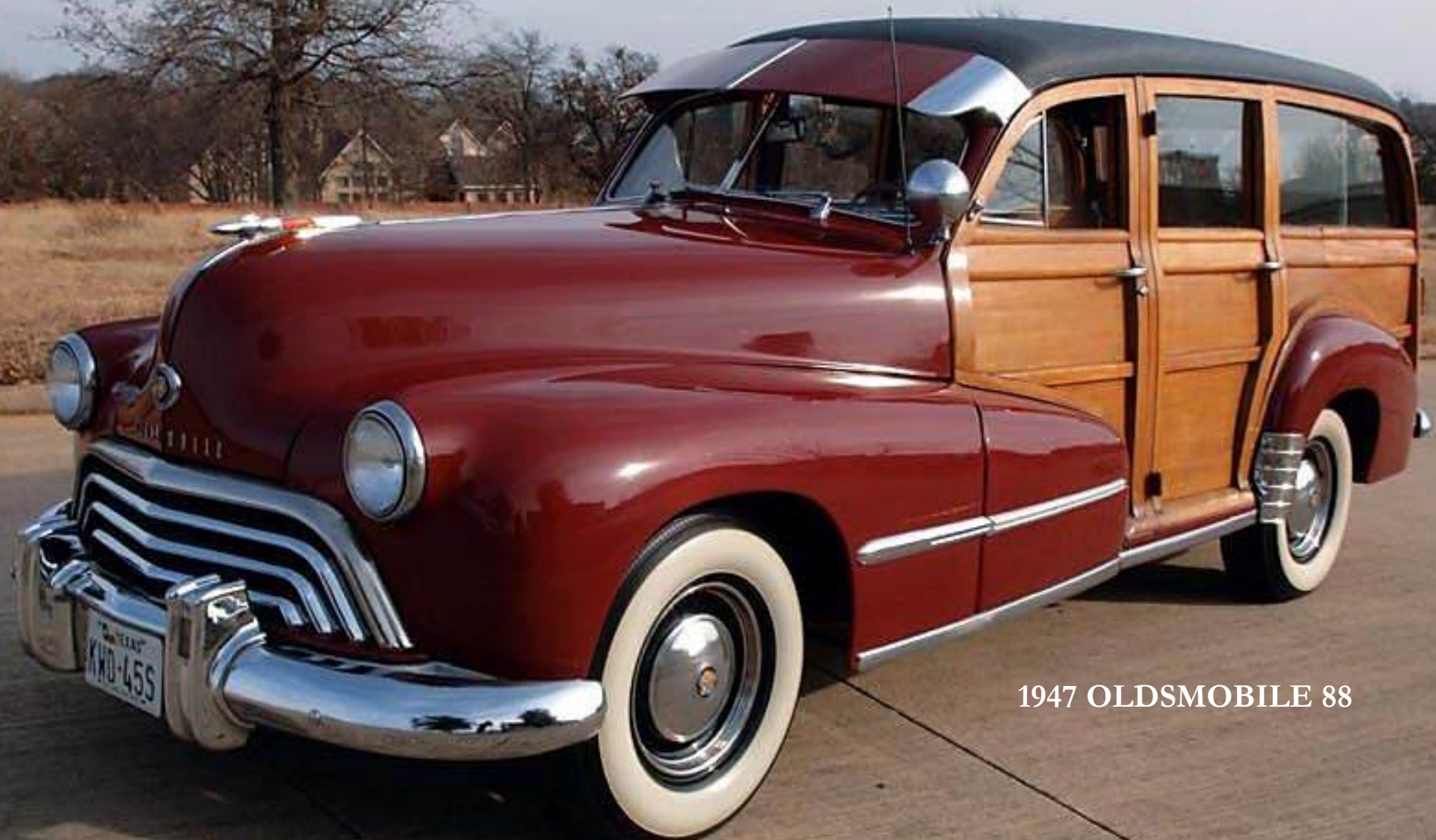
1947 OLDSMOBILE 88