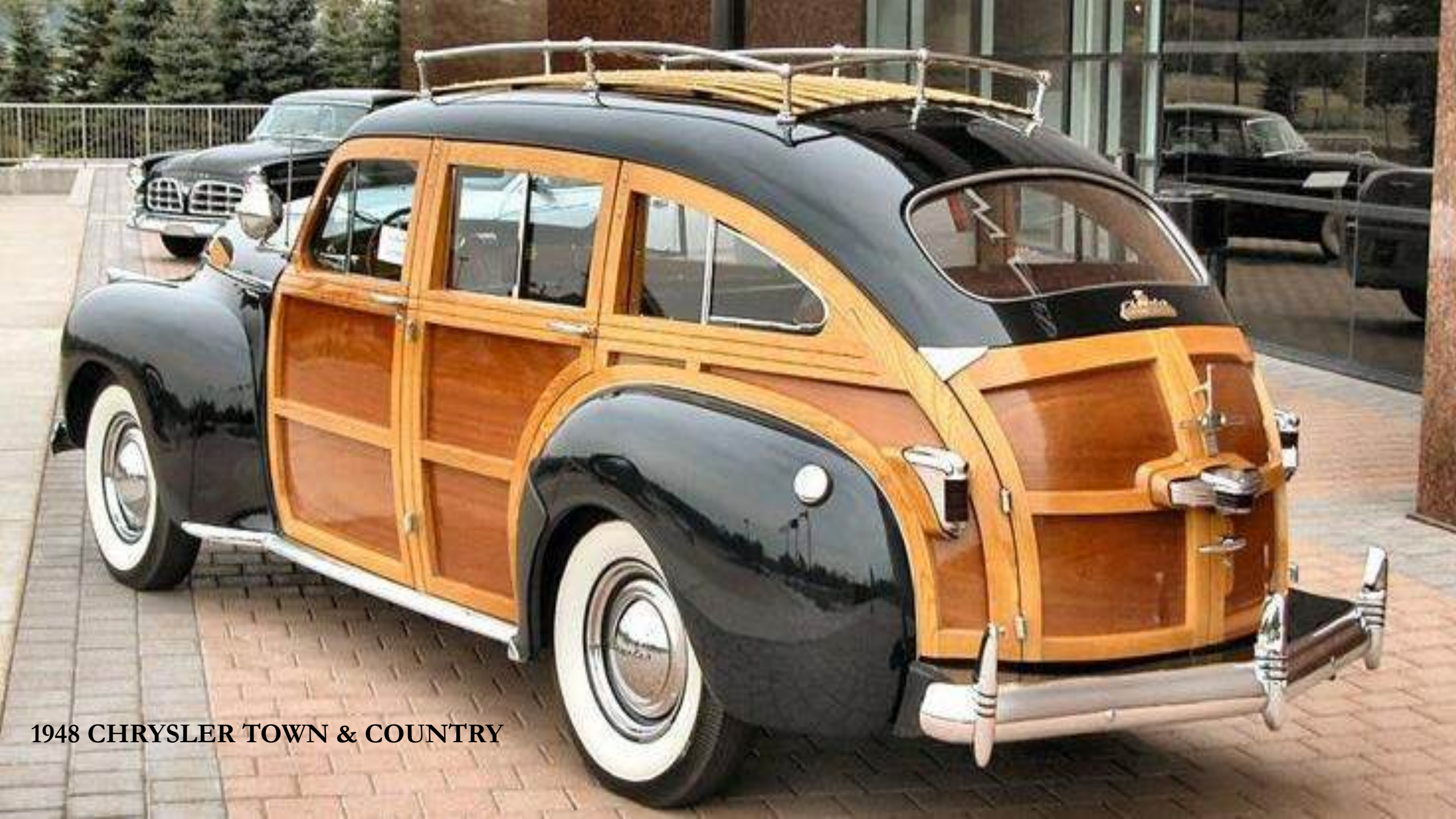
1948 CHRYSLER TOWN & COUNTRY