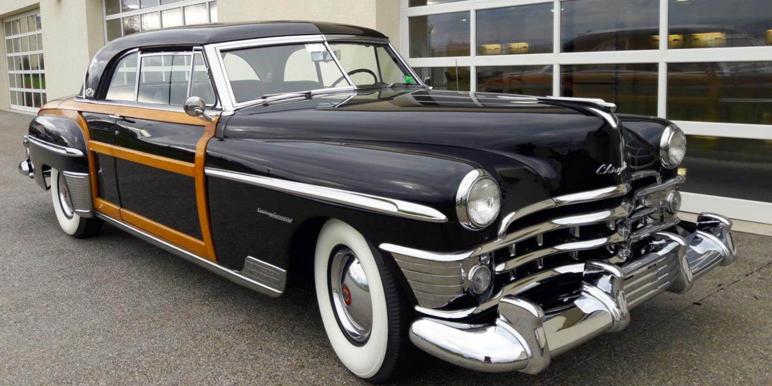
1950 CHRYSLER TOWN & COUNTRY