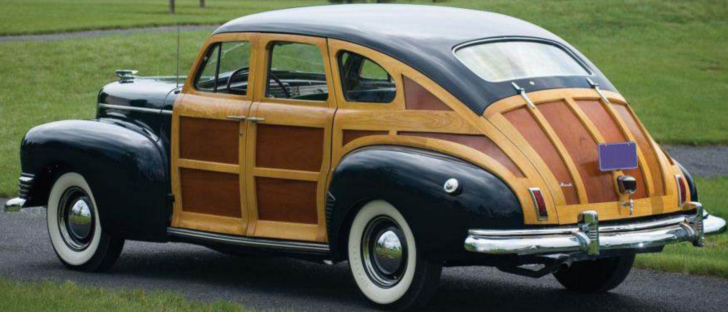
1947 NASH AMBASSADOR