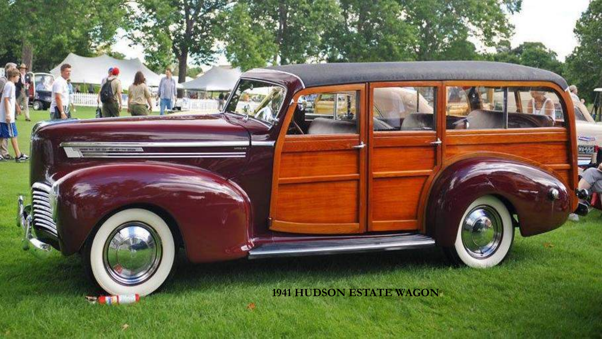
1941 HUDSON ESTATE WAGON