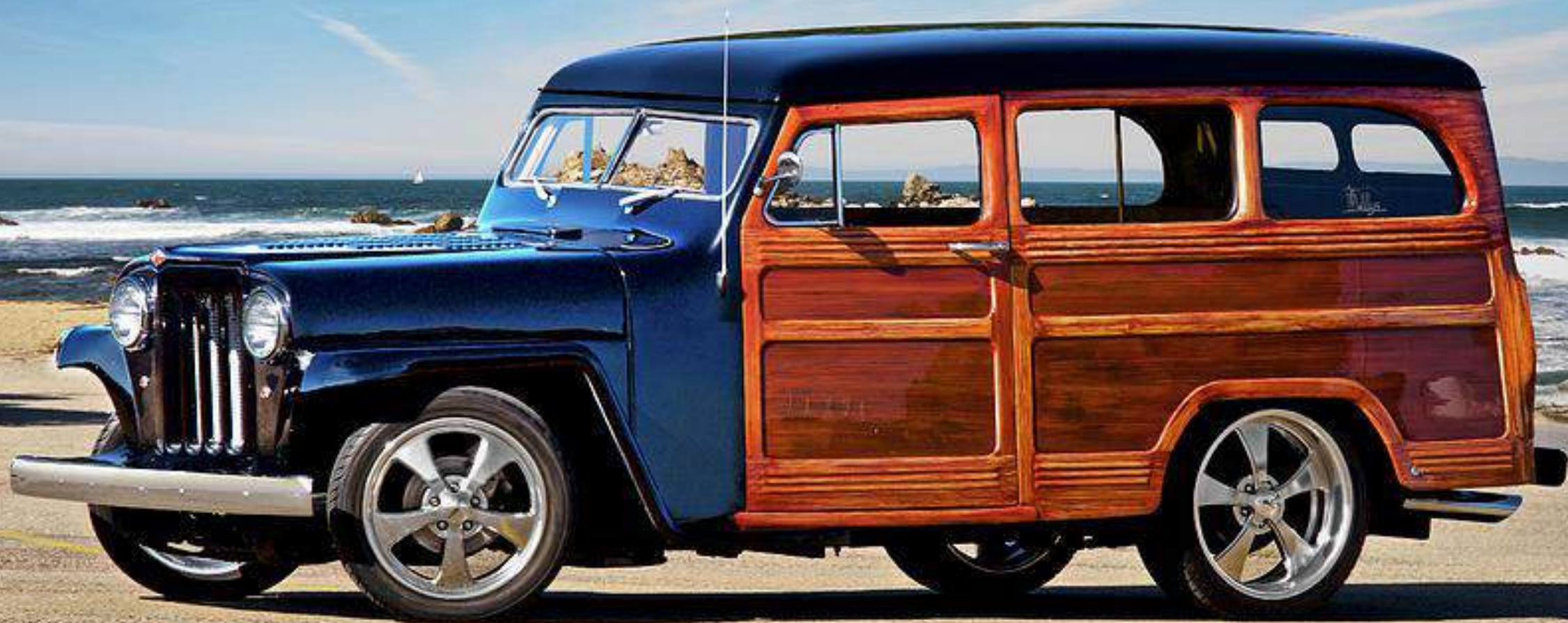
1949 WILLYS JEEP