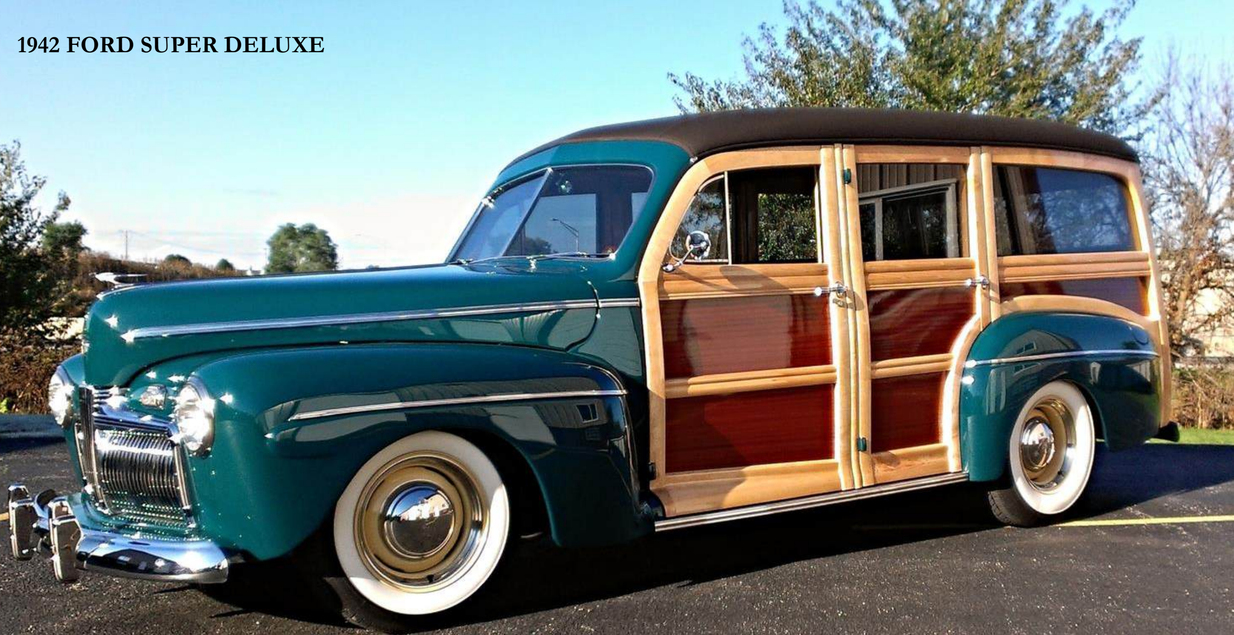
1942 FORD SUPER DELUXE