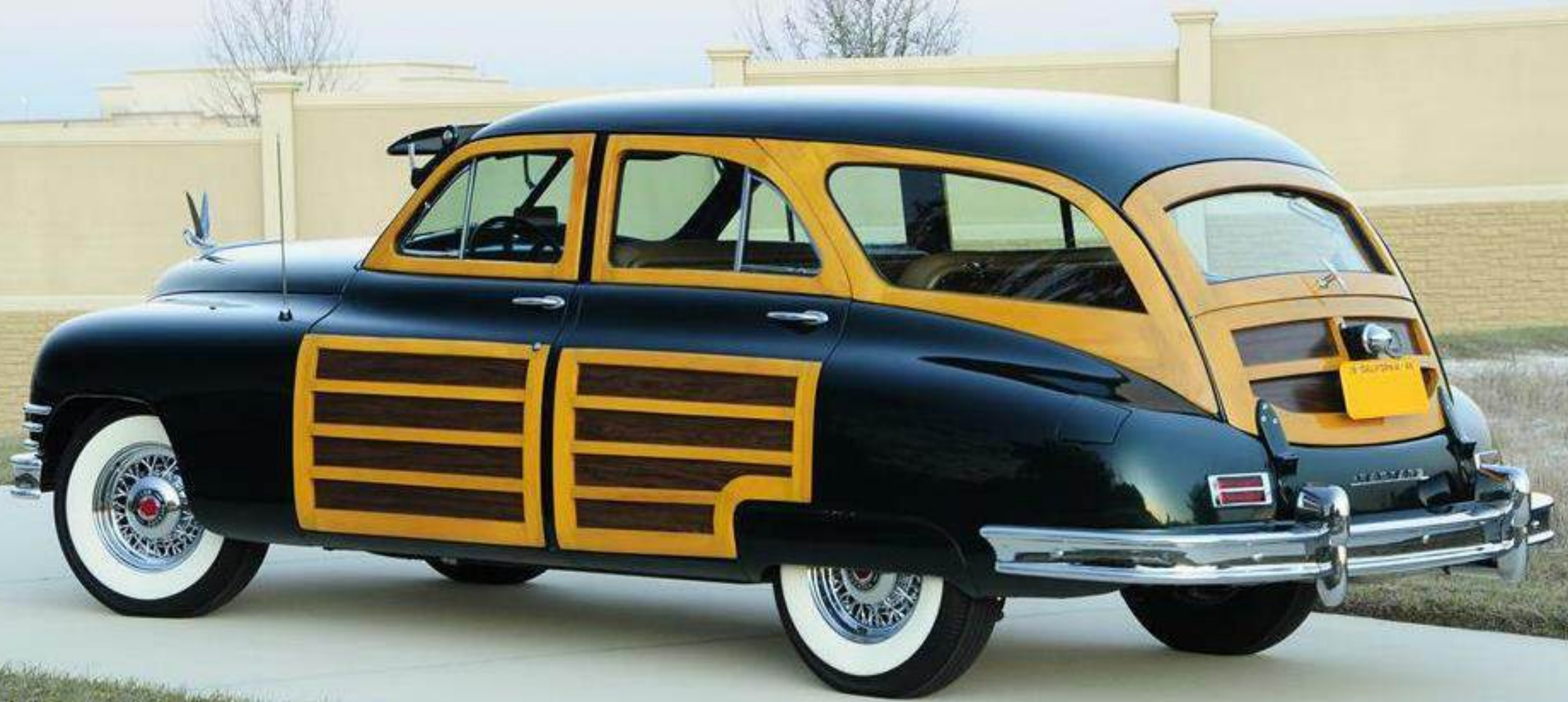
1948 PACKARD CLIPPER