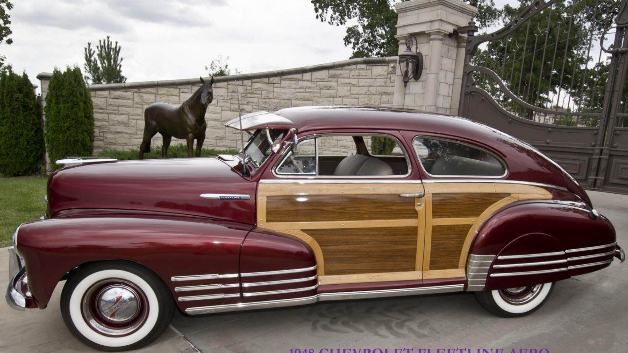
1948 CHEVROLET FLEETLINE AERO