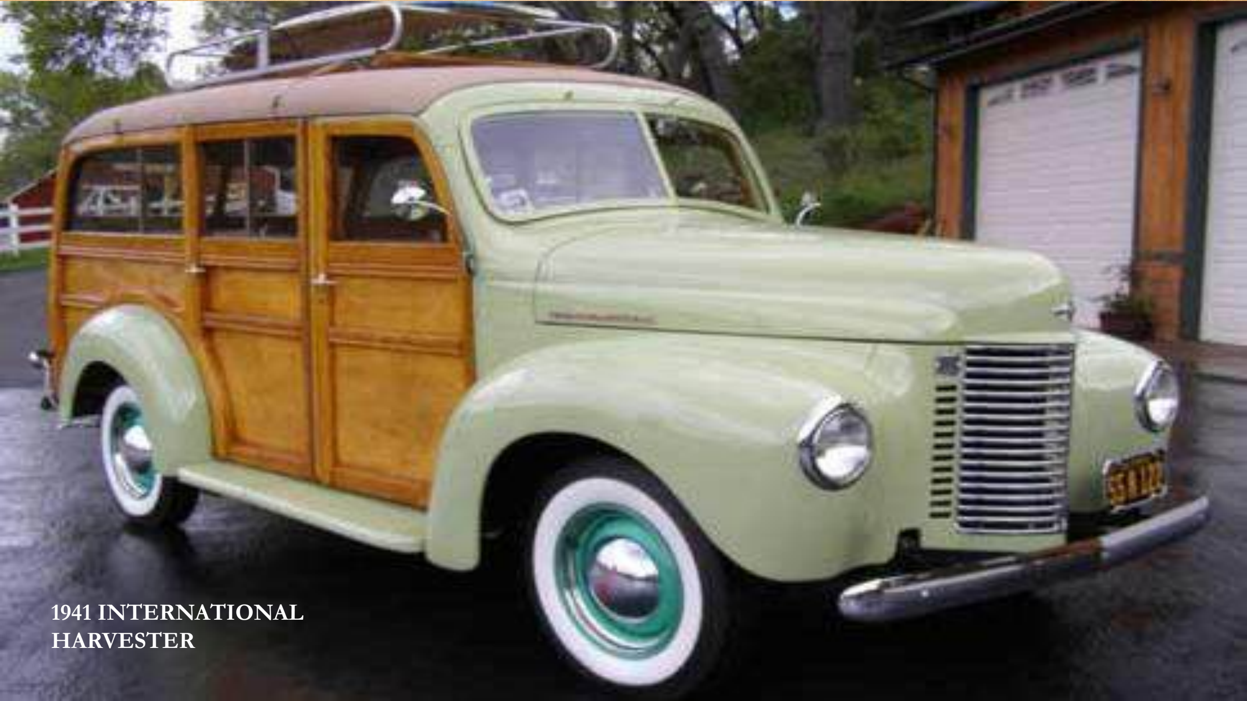
1941 INTERNATIONAL HARVESTER