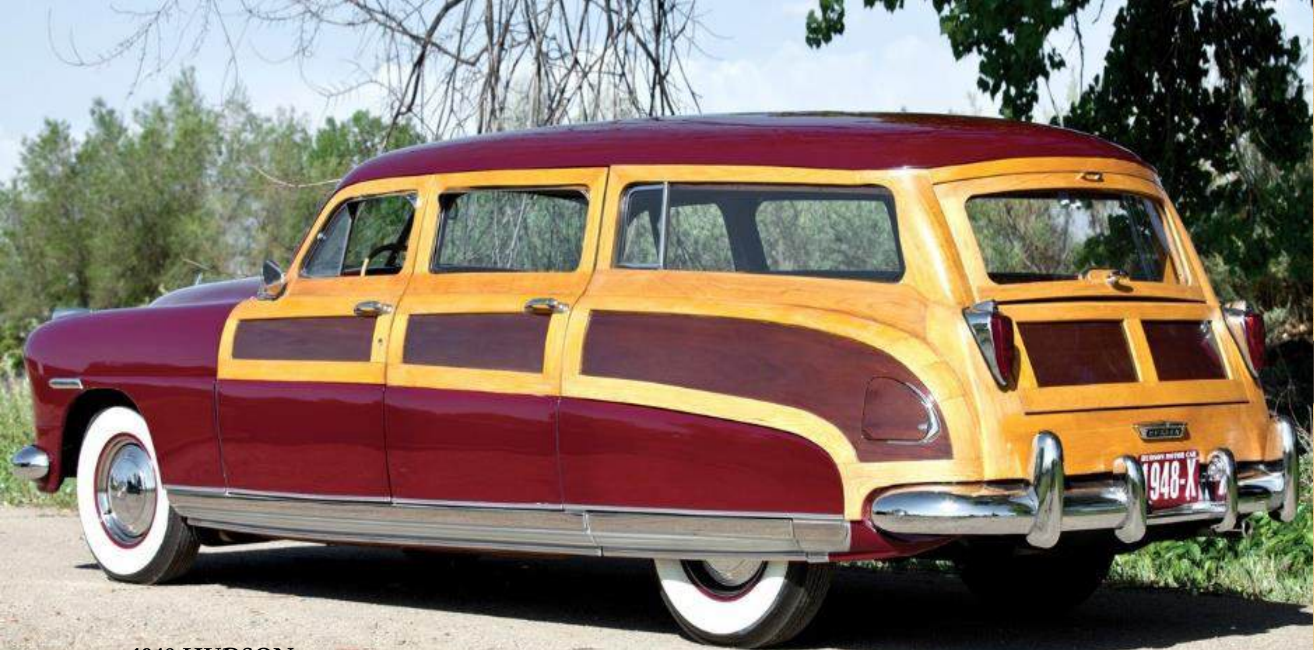
1948 HUDSON COMMODORE