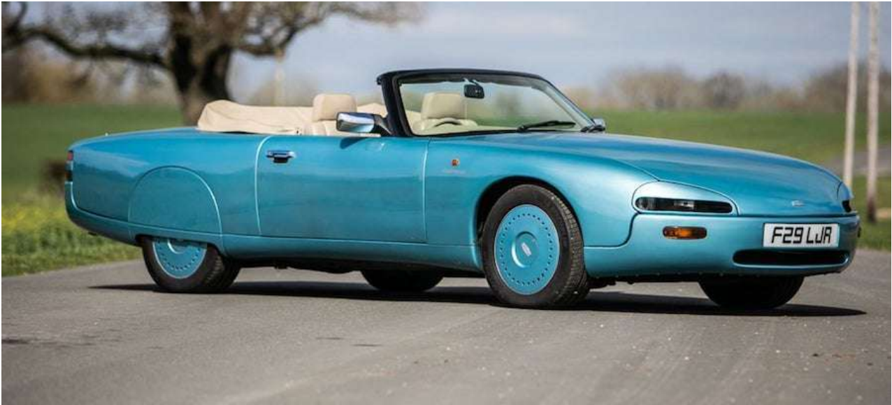
Railton Claremont F29