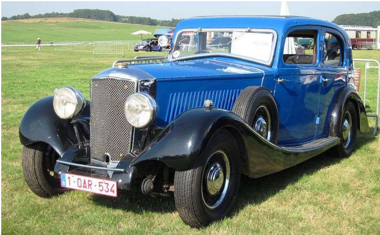
1935 Railton Straight-Eight University saloon