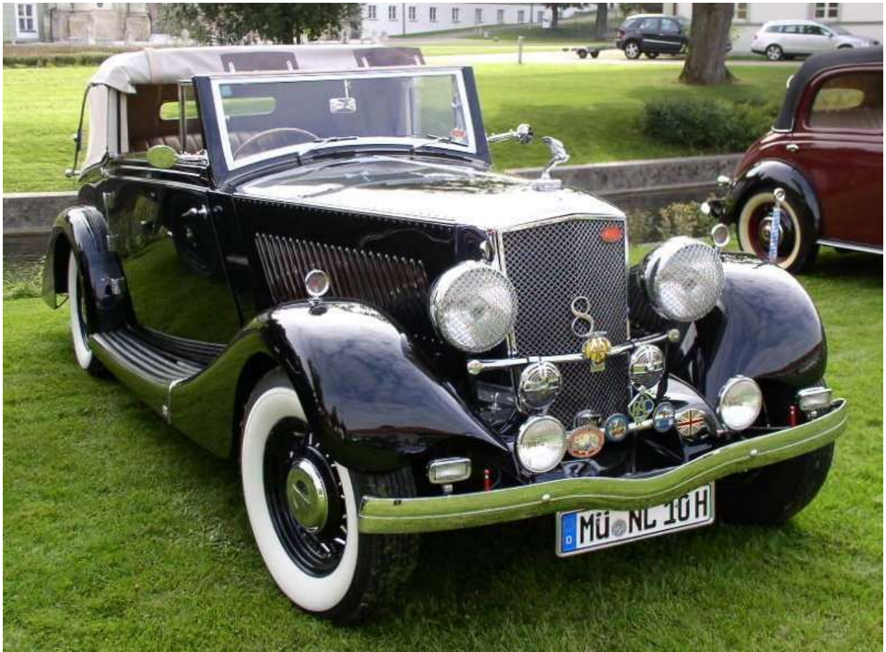
1936 Railton Straight-Eight