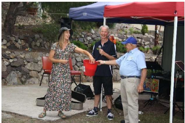
Auction of Memorabilia's