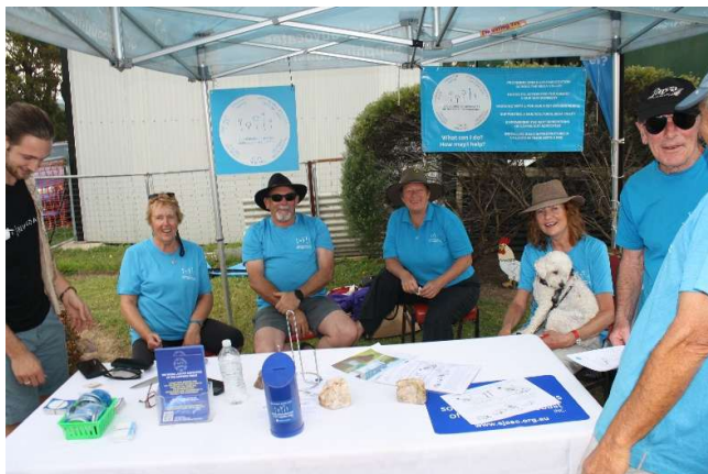
Social Justice Advocates of Sapphire Coast