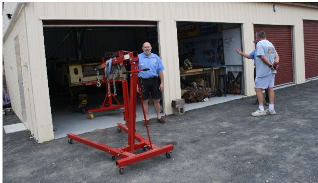
Student Mentoring facility