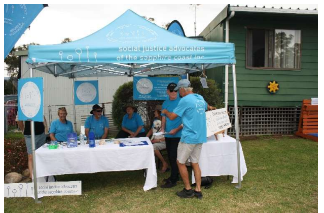
Social Justice Advocates of the Sapphire Coast