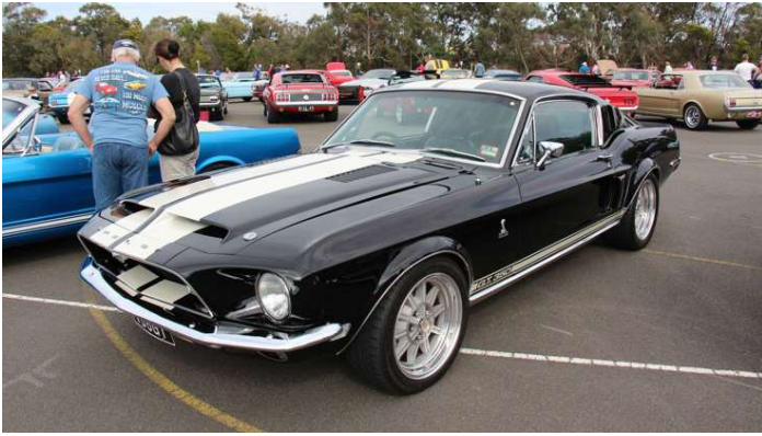
Shelby Mustang GT350

Who does not love a good Mustang? Better yet, who does not love a reliable supercar equipped with knockout racing stripes? First gen models were released in the '60s (the ones we love best) with today's versions still boasting impressive paint jobs and those signature stripes.