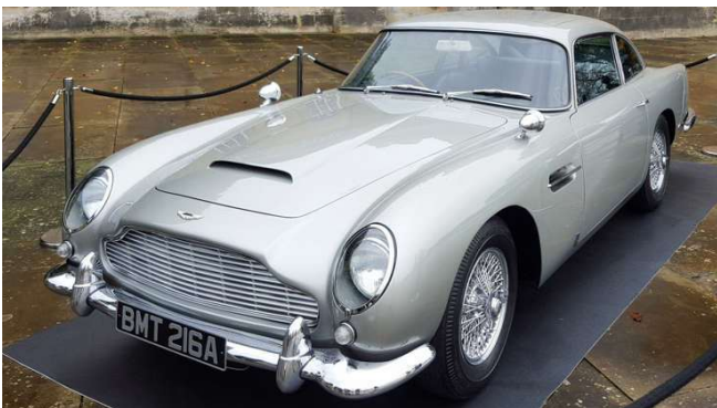
Aston Martin DB5

Who does not love a good Mustang? Better yet, who does not love a reliable supercar equipped with knockout racing stripes? First gen models were released in the '60s (the ones we love best) with today's versions still boasting impressive paint jobs and those signature stripes.