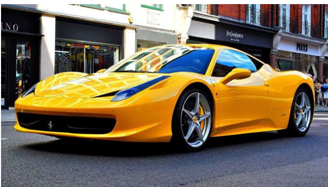
Ferrari 458 Italia

If we are going to talk about gorgeous cars, you know we are going to talk about James Bond's car. Not only has this model appeared in several films, but it has also become synonymous with 007. Some days, we are not sure which is cooler.