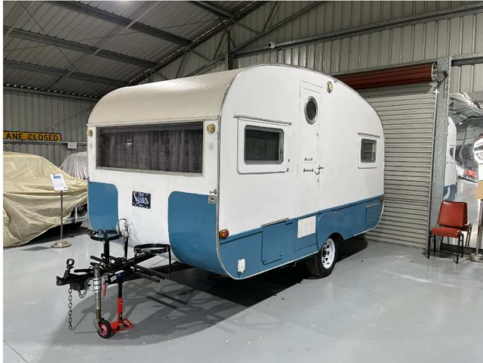
57 BONDWOOD CARAVAN

I’ve also ordered a sticker for the van with her new name: Elly May. ”