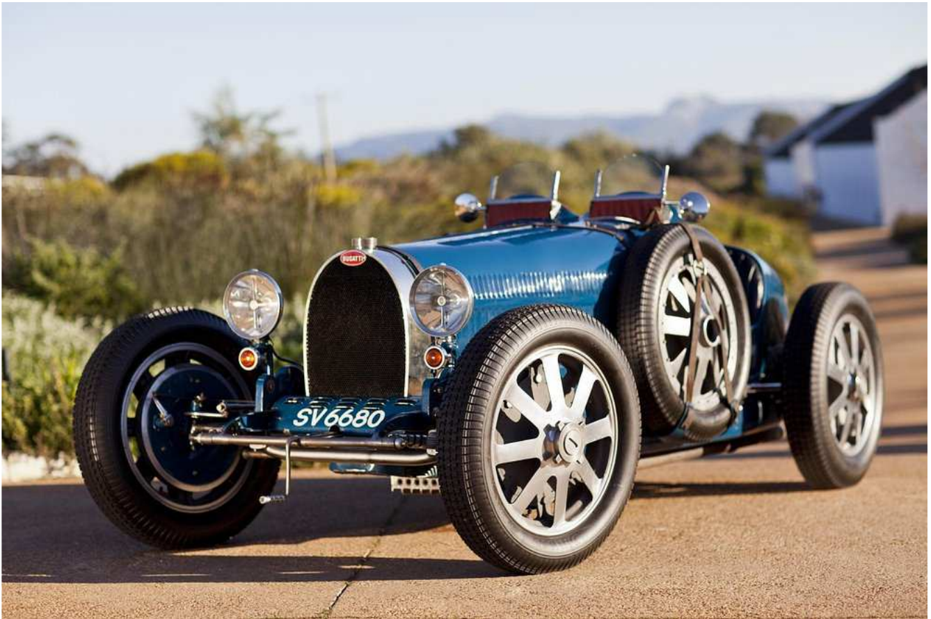
BUGATTI TYPE 35B