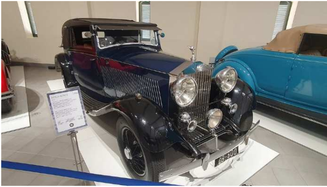
Rolls Royce 1936