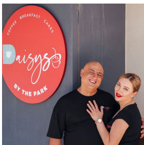
"Daisy's By The Park" How long a table do we need

What a beautiful morning with an easy drive to Dundas for the start of our outing. Our morning tea was at "Daisy's By The Park" at the local shopping centre opposite Dundas Park. I had booked in, but more and more people kept turning up, so they had to put out more tables and chairs which they were happy to do and made us all welcome.