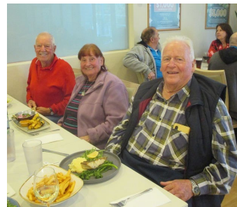
Yes, we booked in too

I spoke to the Chef and explained I had more than I had booked in, but being mid-week, he said that was O.K. NOW YOU CAN SEE WHY I STRESS TO BOOK IN WITH ME & NOT JUST TURN UP ON THE DAY & IF YOU DO BOOK IN "PLEASE TURN UP" . Many thanks to 36 people who attended.