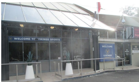
Viking Sports Club

With a great menu, at this very popular café, morning tea was soon consumed. Time to leave for lunch which was just a couple of minutes away around the corner at Vikings Sports Club. Upon arrival there were even more people there who had not come to morning tea or booked in. As there was already a large group booking there in the partitioned off area of the dining room we soon filled up the remaining area except for a small table of four.