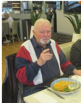
No, I definitely booked