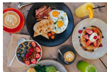
Boy, that makes me hungry

With a great menu, at this very popular café, morning tea was soon consumed. Time to leave for lunch which was just a couple of minutes away around the corner at Vikings Sports Club. Upon arrival there were even more people there who had not come to morning tea or booked in. As there was already a large group booking there in the partitioned off area of the dining room we soon filled up the remaining area except for a small table of four.