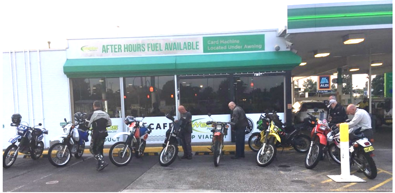
Early start from BP Viaduct Cafe to beat the heat

Today we tried something a little different re starting times. Twelve riders meeting at 6.00am leaving after coffee at 6.30am.