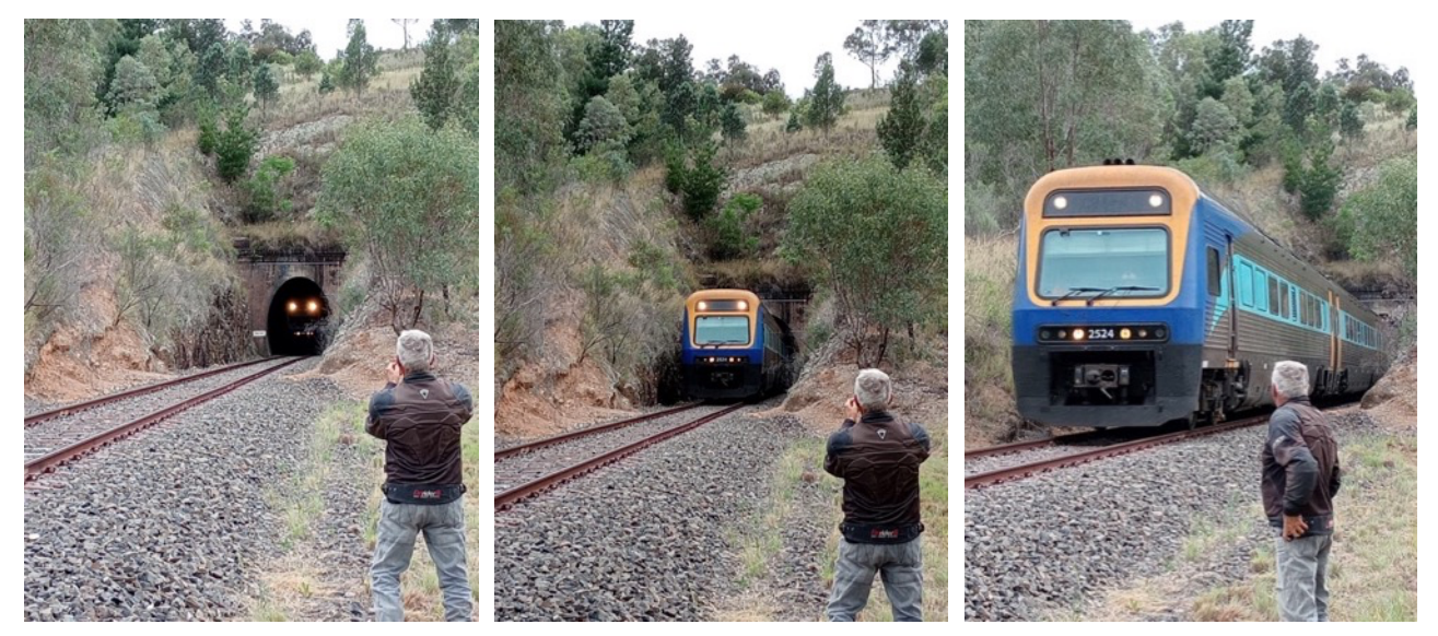
Barry standing beside rail tracks taking photos of the Explorer train coming out of the tunnel

Really enjoyed the ride today with a good bunch of blokes (club members and guests). Arrived home at 10.30 travelling about 180klms. This our last dirt ride for 2024 but maybe a few more early starts in 2025. Must mention that we didn't climb through any fences or open any gates to view the train, just parked our bikes on side of track.