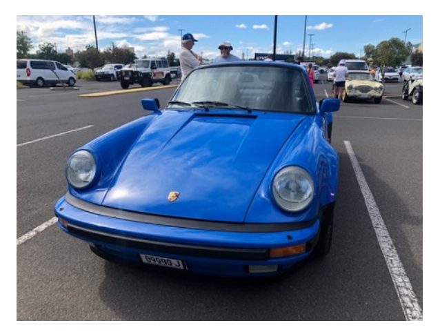
Brian Wiggs 1981 Porsche

We enjoyed a long chat over coffee inside in air conditioned café with Warwick and Allison. They bought some plants before heading off to their new unit in town. - Val Grout