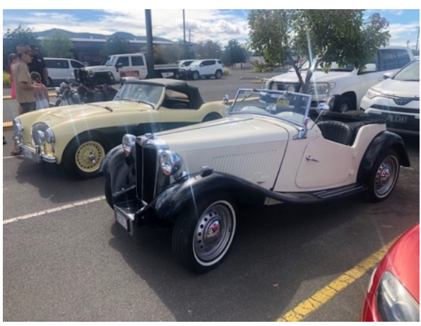
1952 MG TD