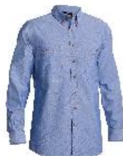
Long Sleeve Shirt with Embroidered Club Logo