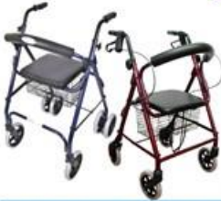
Walkers from $60

Bathroom Aids, Chairs, Children's Equipment, Home Aids, Power Wheelchairs, Pressure cushions, Scooters, Walkers, Wheelchairs - Manual / Transit / Accessories