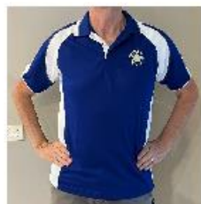
Mens Polo Shirt with Embroidered Club Logo