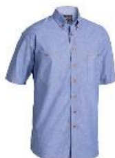
Short Sleeve Shirt with Embroidered Club Logo