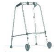
Zimmer Frame $30