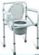
Commodes, From $40