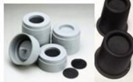
Chair Raisers $20