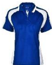
Ladies Polo Shirt with Embroidered Club Logo