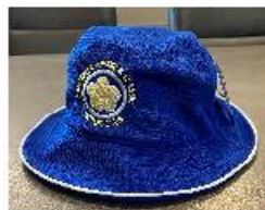
Club Bucket Hat with Embroidered Club Logo