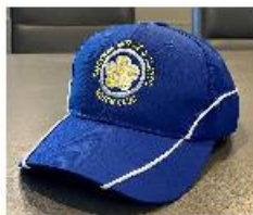
Club Cap with Embroidered Club Logo