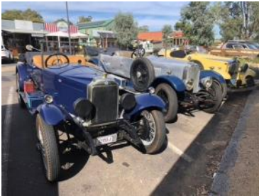
Early Vauxhalls parked at Glenrowan.

The afternoon was spent driving north east to Milawa and Eldorado. Here we visited the Historic gold dredge.