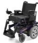
Scooters & Power Wheelchairs From $600