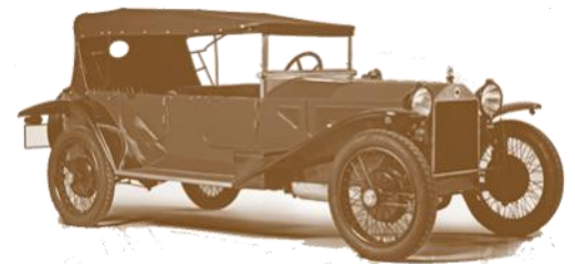
1922 Lancia Lambda