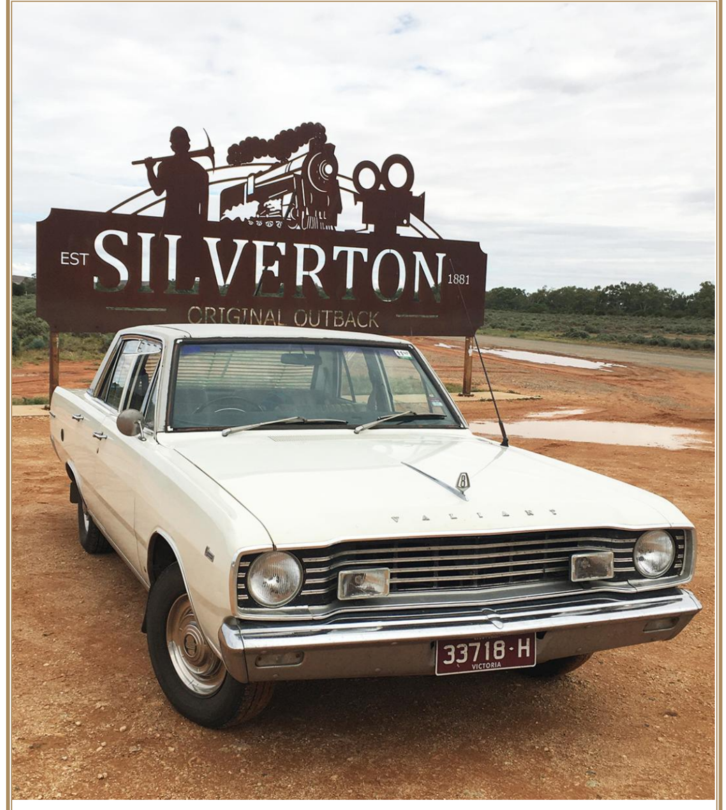
Manny & Lil Vella's 1967 Valiant on the Broken Hill Rally, Easter 2024.

PO Box 200 Newcomb VIC 3219. Clubroom: Showgrounds, 79 Breakwater Rd East Geelong. Club meetings: 7.30pm 2<sup>nd</sup> Tues each month.