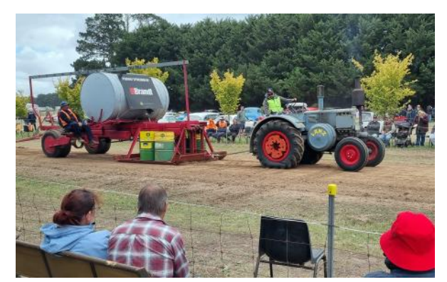
BACKFIRE - Volume 58, No 10 – March 2025