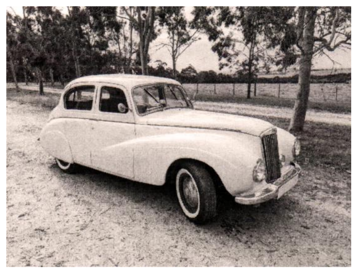
The Car in Question - the Sunbeam Talbot 90