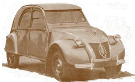
1955 Citroen 2 CV