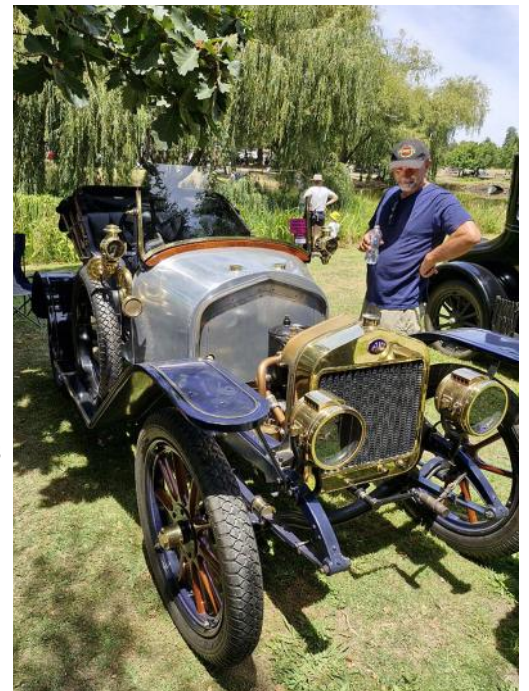
Photo: one of the beautiful cars on display at Cruden Farm