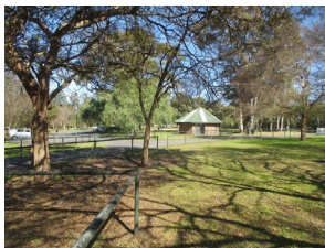
The Weir park

From 10.30am Members started to slowly trickle into the park, one car at a time.