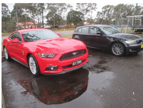
A nice day out

Well, the best way to describe the start of today's outing was, cold, wet, windy and a very unpleasant day. Off to McDonalds at McGraths Hill which gave us some comfort inside, out of the elements.