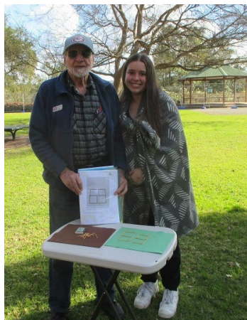
The Quiz Master and his grand daughter

So, we started to pack up and make our way home.