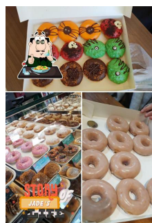
Patrick's Health Food