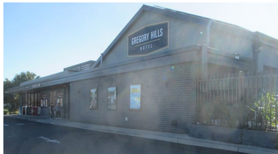
This must be the place

Once seated and lunch orders taken Helen then handed out the question sheets and stipulated that "phones were not allowed to be used to find the answers to the questions."