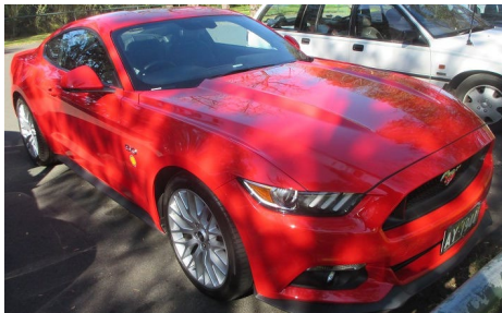
With car rides and