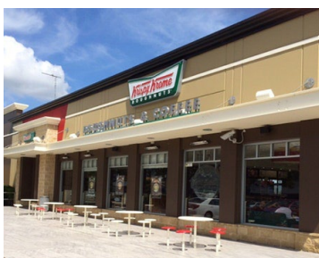
The Home of Health Food