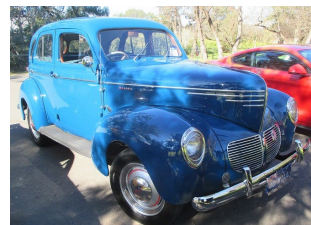
a couple of flash arrivals