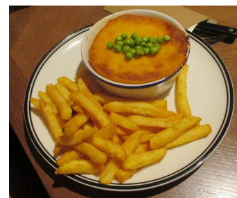
The fare to be consumed

I waited outside until everyone finally arrived and then ventured inside to a wonderfully comfortable and warm dining area with our tables set out and a log fire burning in the dining area. Drink and lunch orders were soon placed, with a broad selection and competitive prices, and they were quickly served and consumed.