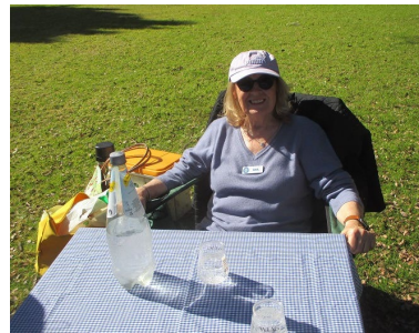
soaking up the sunshine

For details of the Oasis Run." - see page 7. ACMC Ladies Day & President's Run - see pages 5-6 & 9-10.