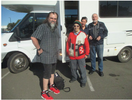
They came to Ladies Day by the bus load

OFFICIAL JOURNAL OF THE ANTIQUE AND CLASSIC MOTOR CLUB Inc.