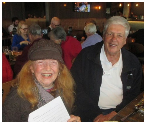
That's ok, I know all the answers

An enjoyable lunch and desserts were soon consumed in the very comfortable dining area.