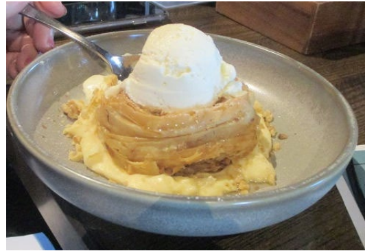
and you can see why