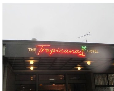
The Hotel of lost travelers

Soon it was time to depart for lunch with simple instructions, Turn Right at the roundabout at Windsor Bridge, Turn Right at Rose Street, Wilberforce, Simple? I thought so, but many got lost finding the Hotel. Blame it on the weather and poor visibility.