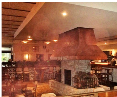
Now that's a fireplace

Soon it was time to depart for lunch with simple instructions, Turn Right at the roundabout at Windsor Bridge, Turn Right at Rose Street, Wilberforce, Simple? I thought so, but many got lost finding the Hotel. Blame it on the weather and poor visibility.