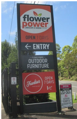
Flower Power becomes

A very busy place with extensive car parks almost full.