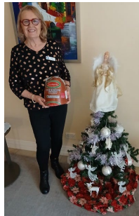
The Raffle Queen