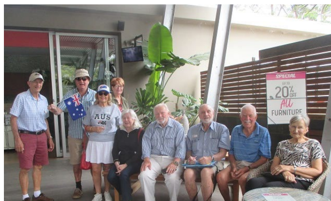
A selection of Members, not meals

With 14 members present we descended on Frankies Food Factory, which was again very busy, but our table awaited, and we all settled down to pour over the extensive menu.