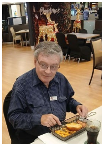
Haberle's shouting? Stay away from Dad