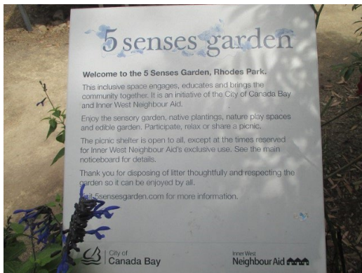
The 5 senses Garden