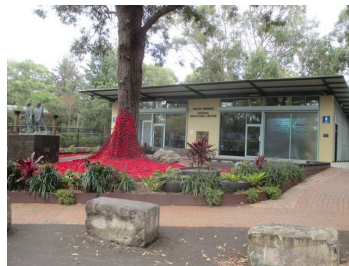
The Garden's Education Centre