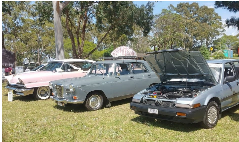
Some of our Members' cars are on display at Linnwood House

OFFICIAL JOURNAL OF THE ANTIQUE AND CLASSIC MOTOR CLUB Inc.