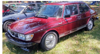
A selection of ACMC Members' cars

It was a pleasant day with a lot of interest in the cars & bikes on display & things started winding down about 1.00pm & by 2.00pm all the cars had left except for two Wolseleys & one Ducatti motorcycle but visitors were still coming to view Linnwood House right up to 3.00pm.