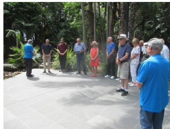
A solemn gathering