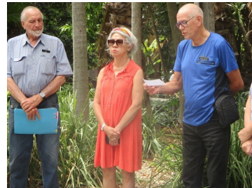
The Prayer of the Nation

Packing up morning tea we then adjourned to the 5 Senses Community Garden. After explaining about community gardens members inspected the healthy-looking vegetables etc. Jacob and I planted some Mint and Strawberries in two of the raised garden beds.