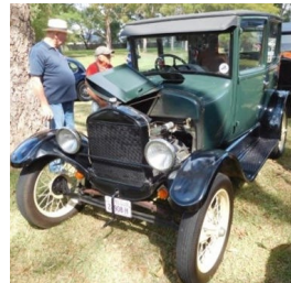
Oh, another T Model Ford.