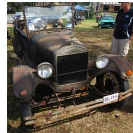
Two more traditional model T Fords.

I was kept busy doing traffic control on the gate for the 70 odd cars and motor bikes who came to display and other cars of the general public. This event was advertised, and we had a good response with many visitors.