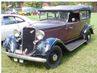
A Dodge 6 (How did that get in here)

It was a pleasant day with a lot of interest in the cars & bikes on display & things started winding down about 1.00pm & by 2.00pm all the cars had left except for two Wolseleys & one Ducatti motorcycle but visitors were still coming to view Linnwood House right up to 3.00pm.