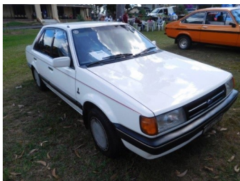
Les' Johnny Come Lately

Off to an early start for our display day arriving at Linnwood by 8.30 am. Myself and the other volunteers soon started setting out the chairs, tables, bunting, garbage bins, barbecue area, dining room etc. and this was accomplished very quickly. Gary had also arrived early, and we parked near the shady trees.